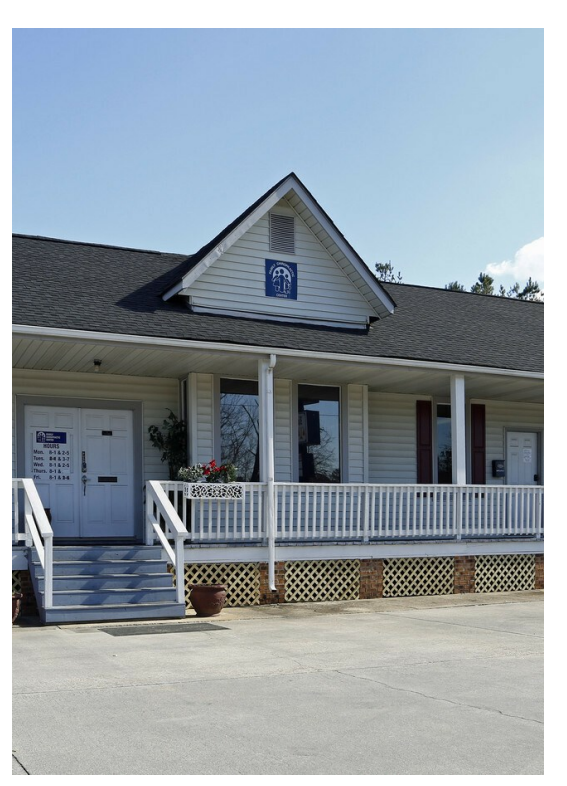
753 S Main St 753 S Main St, Raeford, NC 28376