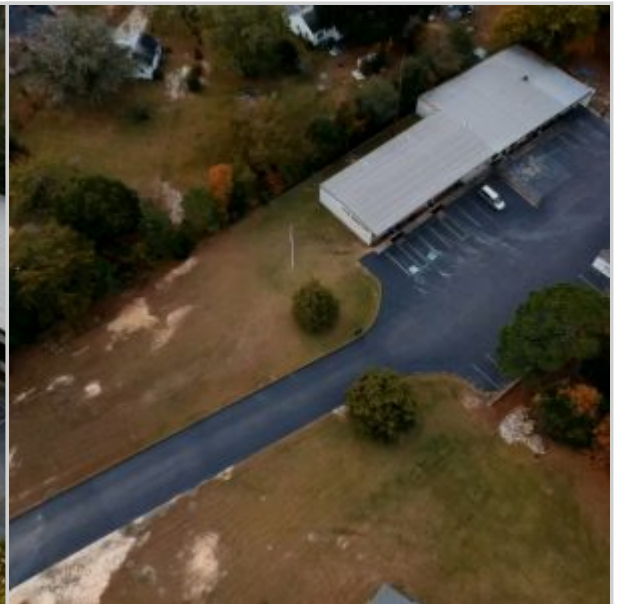
Aerial – Driveway