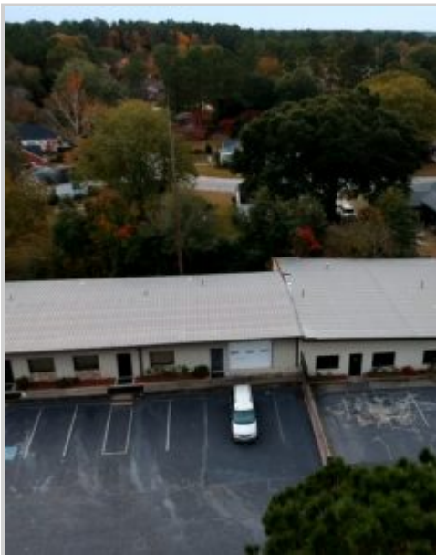
Aerial – Front