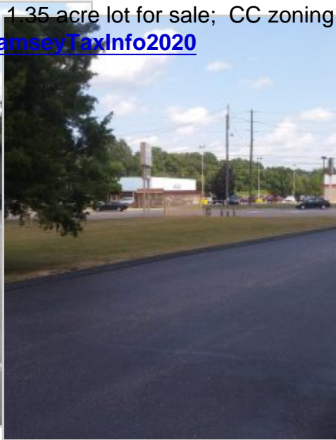
View from Ramsey St